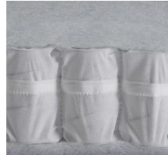
NORDIC Spring medium thick layer of fiberfill Pocket spring Fiberfill approx. 15 cm high