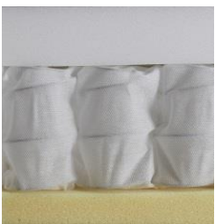
NORDIC Soft Spring extra soft 1 layer of hyper soft foam membrane bound pocket spring 1 layer of hyper soft foam approx. 18 cm high

Every single mattress is handmade with great care and attention to quality and details at the INNOVATION LIVING™ factory in Denmark.