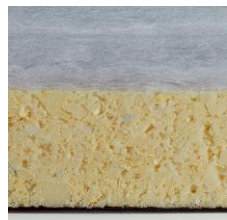
NORDIC Classic firm Fiberfill freon-free polyether foam Fiberfill approx. 13 cm high