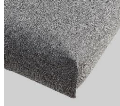
Nordic Cover round