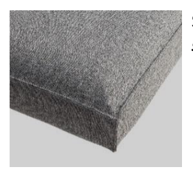
Sharp Plus Cover sharp