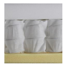
NORDIC Soft Spring extra soft

Fiberfill Latex core Fiberfill appr. 13 cm high