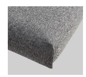
Nordic Cover round