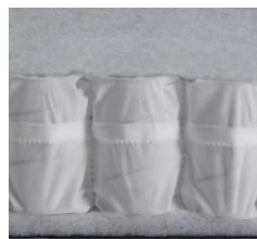
NORDIC Spring medium thick layer of fiberfill Pocket spring Fiberfill appr. 15 cm high