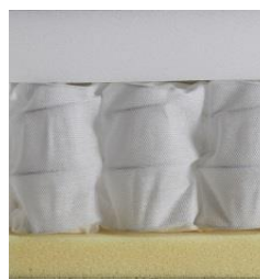
NORDIC Soft Spring extra soft 1 layer of hyper soft foam membrane bound pocket spring 1 layer of hyper soft foam appr. 17 cm high

Every single mattress is handmade with great care and attention to quality and details at the INNOVATION LIVING ™ factory in Denmark.