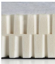
NORDIC Latex medium Fiberfill Latex core Fiberfill appr. 13 cm high