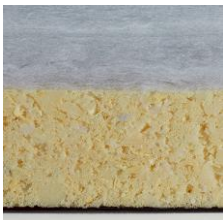
NORDIC Classic firm Fiberfill freon-free polyether foam Fiberfill appr. 13 cm high