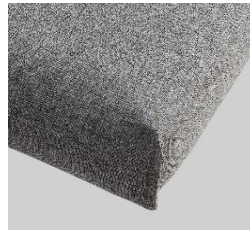
Nordic Cover round