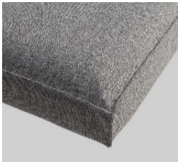
Sharp Plus Cover sharp