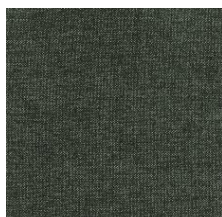
281 AVELLA PINE GREEN