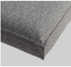
Sharp Plus Cover sharp