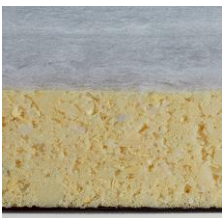
NORDIC Classic firm Fiberfill freon-free polyether foam Fiberfill appr. 13 cm high