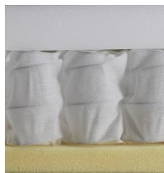
NORDIC Soft Spring extra soft 1 layer of hyper soft foam membrane bound pocket spring 1 layer of hyper soft foam appr. 17 cm high

Every single mattress is handmade with great care and attention to quality and details at the INNOVATION LIVING™ factory in Denmark.