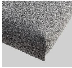
Nordic Cover round