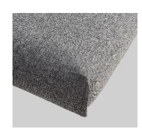
Nordic Cover round