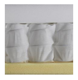
NORDIC Soft Spring extra soft

1 layer of hyper soft foam membrane bound pocket spring 1 layer of hyper soft foam appr. 17 cm high